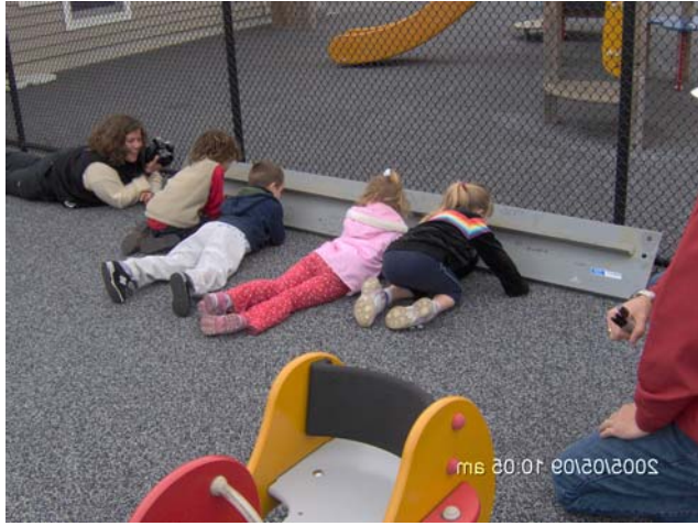
Child Development Center Students make history at Fairview...see accompanying story and picture inside!